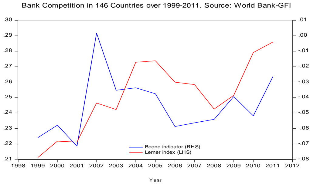
Figure 1a: Evolution of bank competition (World Bank data).

This figure shows the evolution of the averaged Lerner index and Boone indicator across 146 countries.